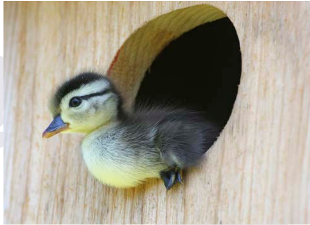
Baby Wood Duck.

A complimentary site visit is required to determine project eligibility.