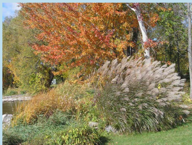
Habitat Enhancement Project