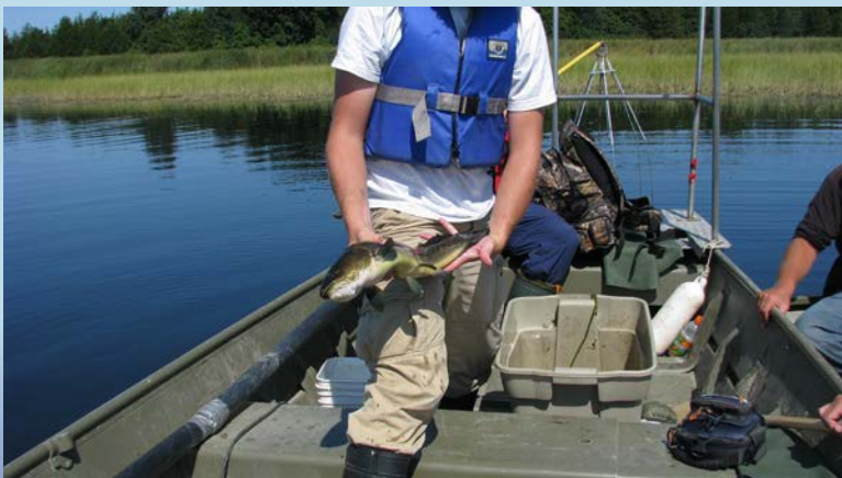
A healthy adult bowfin collected, measured then returned during a fish community survey at a coastal wetland in the Bay of Quinte.