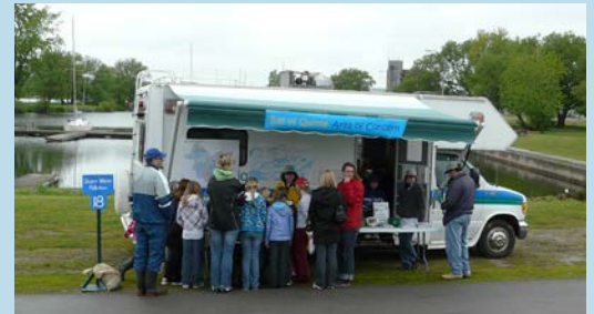
Restoration Council Member from the MOE brought their RV activity centre to the Quinte Children's Water Festival.